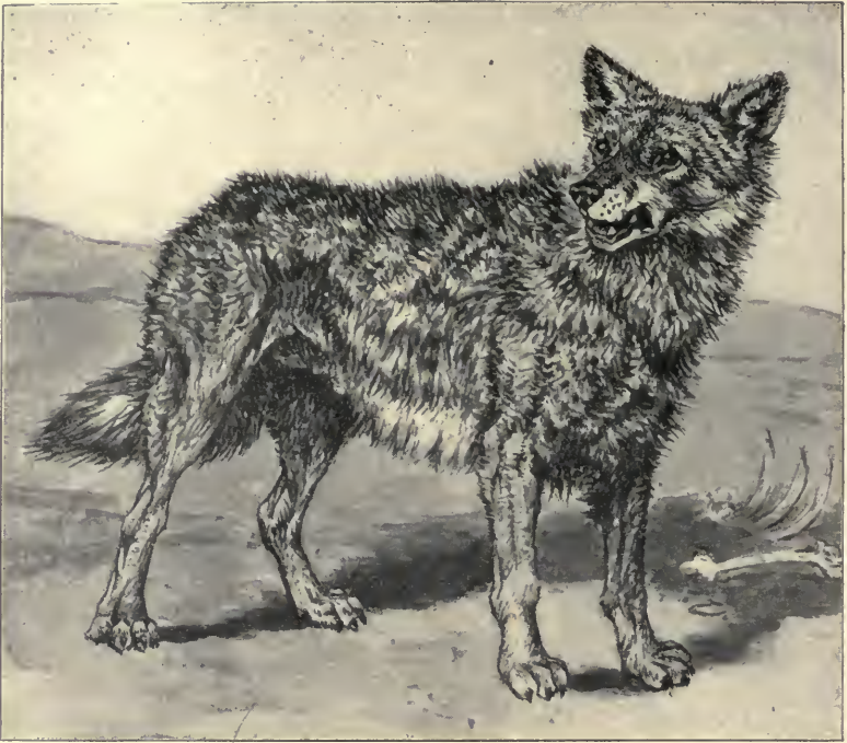
FIG. XLVI. CANIS MEXICANUS. MEXICAN TIMBER WOLF.